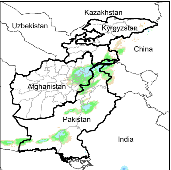
Daily Rainfall estimate for 26 Sep., 2012