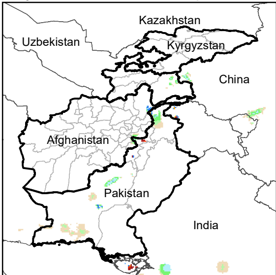
Daily Rainfall estimate for 27 Sep., 2012