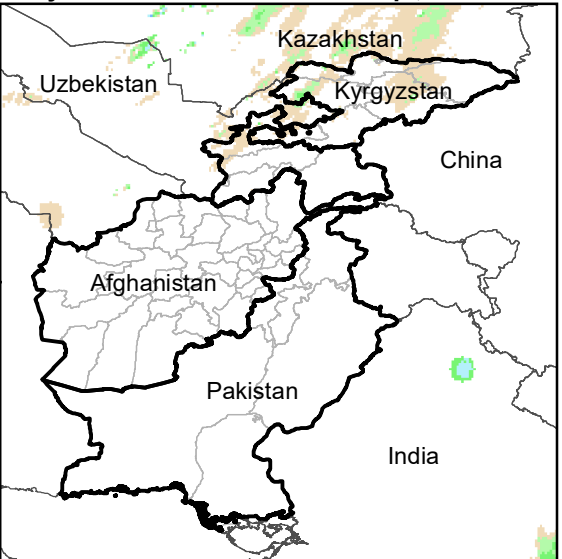
Daily Rainfall estimate for 29 Sep., 2012