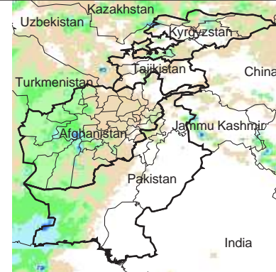
Total Dekadal Rainfall 2013